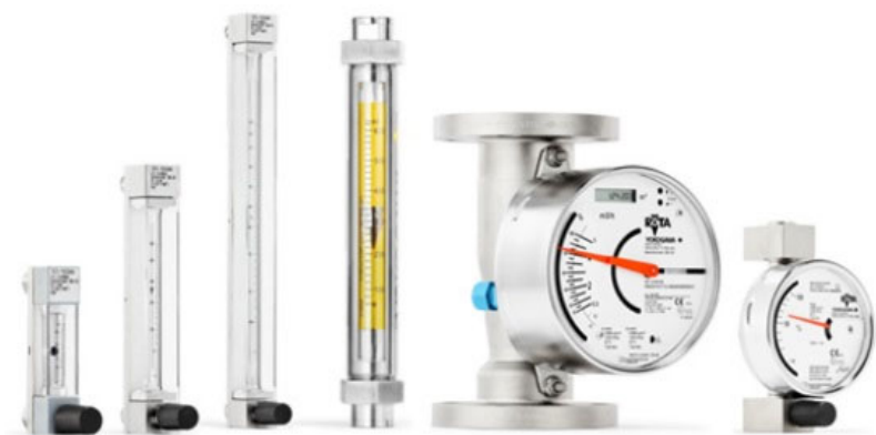
Yokogawa offers glass and metal variable area flowmeters under the Rotameter name

The market for variable area (VA) flowmeters is growing as suppliers introduce improvements to meet the increasingly sophisticated needs of today’s users, according to our first-ever VA study, The World Market for Variable Area Flowmeters , published in October ( www.flowva.com ). The study found that worldwide VA meter revenues totaled $280 million in 2019 and forecasts a compound annual growth rate (CAGR) of just above one percent worldwide through 2024.