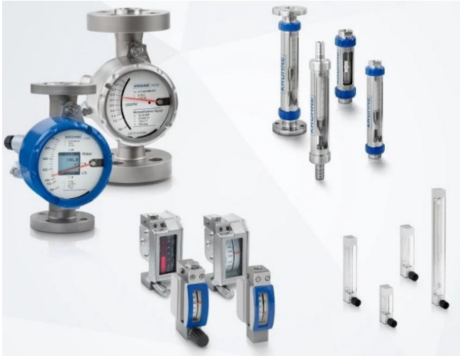
KROHNE VA meters in plastic, glass, and metal

Although most VA meters are still read manually in the field, many can now transmit data to a recorder, programmable logic controller (PLC), or distributed control system (DCS). Even though adding a transmitter with an output signal means the VA meter requires a power supply, it opens opportunities, including aligning with the broader industrial trend for instruments to communicate with each other. Transmitters give VA meters more versatility and make them more suitable for process environments. With a transmitter, for instance, VA meters can serve like a switch, registering flow/no-flow and triggering an action in a process system. Operators