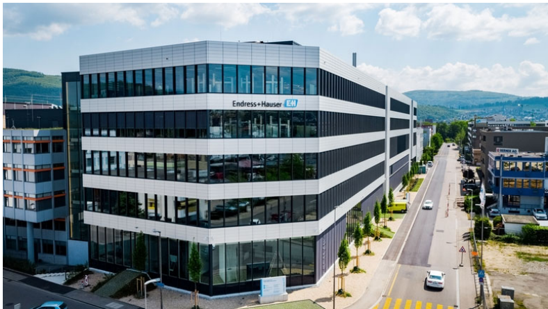
New E+H facility in Reinach inaugurated in July

Endress+Hauser celebrated the opening of a nearly 150-meter-long building in Reinach, Switzerland on July 1, 2022. The new facility, with more than 25,000 square meters of space – about the size of four soccer fields – was built with roughly 19,000 cubic meters of concrete and 2,200 tons of reinforced steel and other materials. Over the past five years the number of employees at the Reinach location in the Swiss canton of Basel-Landschaft has grown by 20 percent to more than 2,000.