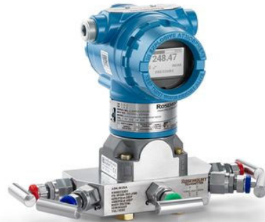
Enhanced Rosemount 3051 pressure transmitter

Built-in diagnostics help the Rosemount 3051 identify issues in electrical loops and impulse lines that could result in the control system receiving incorrect measurements, potentially leading to safety and quality compromising decisions. A built-in diagnostic log tracks all diagnostic events and allows users to always know the device status, even when not connected to the device. Emerson says these capabilities help service technicians address potential problems faster by detecting them early, when they can still be corrected before they jeopardize employee safety, operations, and the environment.