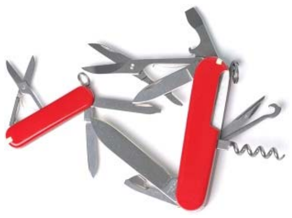
Volume X and Module A give you handy, all-in-one sets of information tools for the world flowmeter market.

We published our first Volume X study in 2003, when the worldwide flowmeter market was $3.1 billion. The market has grown substantially since then, and we've been there to document its growth every step of the way. Our Volume X , 7<sup>th</sup> Edition captures this growth and makes it easy to determine which flowmeter types benefited most from the recovering market.